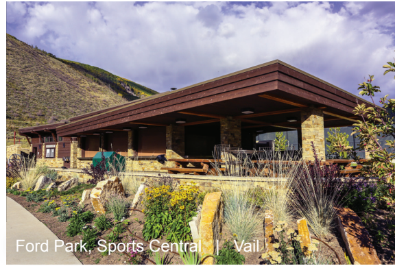
Ford Park, Sports Central | Vail