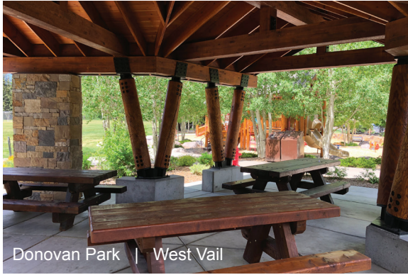
Donovan Park | West Vail