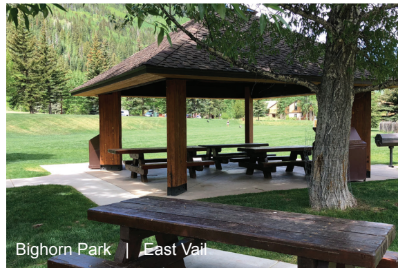
Bighorn Park | East Vail