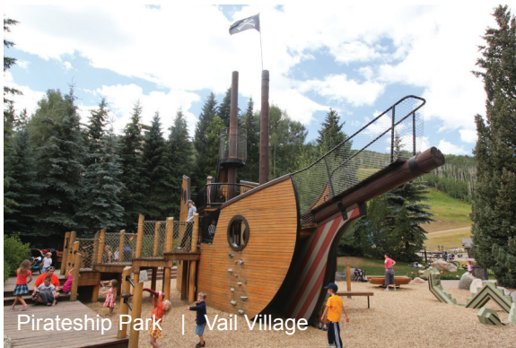
Pirateship Park | Vail Village