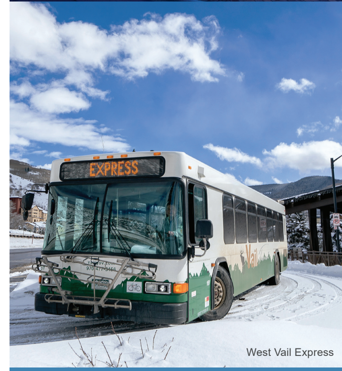
West Vail Express

NEW Vail Transit Real Time Information: ride.vailgov.com