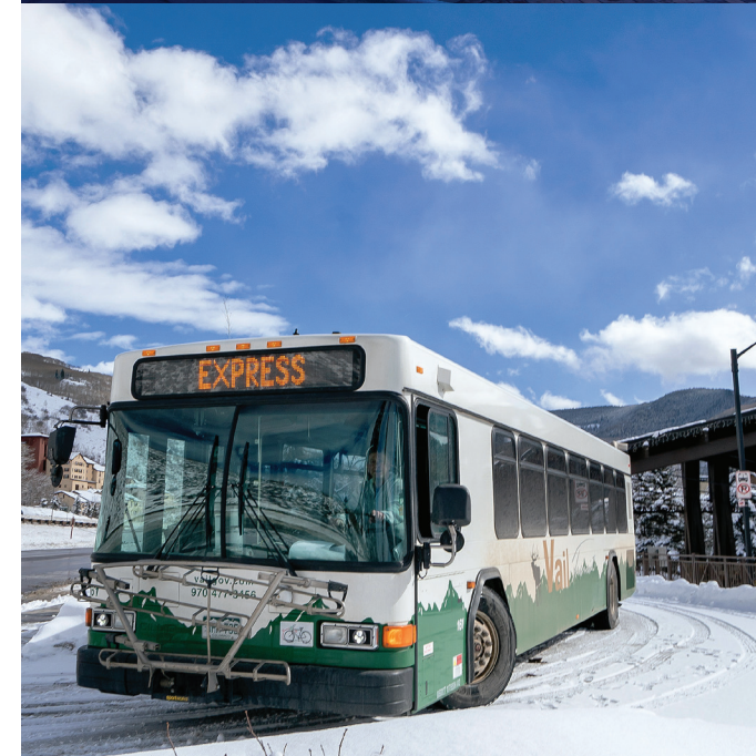
West Vail Express

NEW Vail Transit Real Time Information: ride.vailgov.com