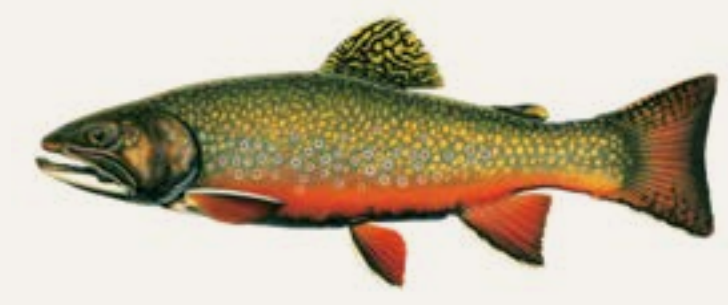
BROOK TROUT Camouflage pattern on a greenish body with a red belly