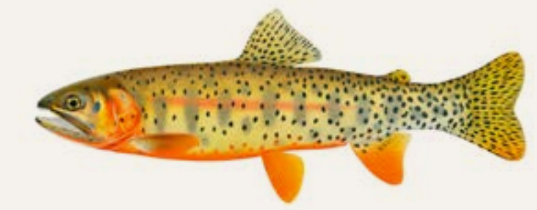
CUTTHROAT TROUT Dense spots near the tail with red patches near the gills and belly