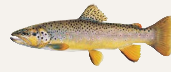
BROWN TROUT Yellow underside with red or orange spots