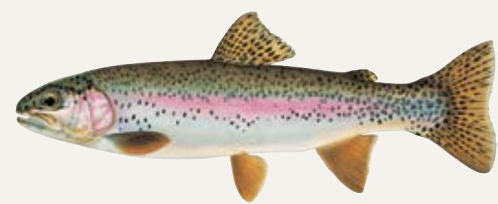
RAINBOW TROUT Pinkish stripe, dense spots all over a silvery body, short rounded nose

Year-round, Gore Creek provides just the right conditions trout need. Spring runoff and the hatching of insects provide a much-needed source of food after the long winter. A diversity of insect larvae ensures a constant food source through summer. The gravel bottom of the creek is necessary for fall spawning and provides sheltered places for eggs to develop and hatch. Larger rocks create calm water downstream for trout to rest and hide from predators. This enables trout to grow into adults, ready to create the next generation.