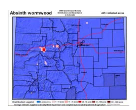
map above by Crystal Andrews, Colorado Department of Agriculture.