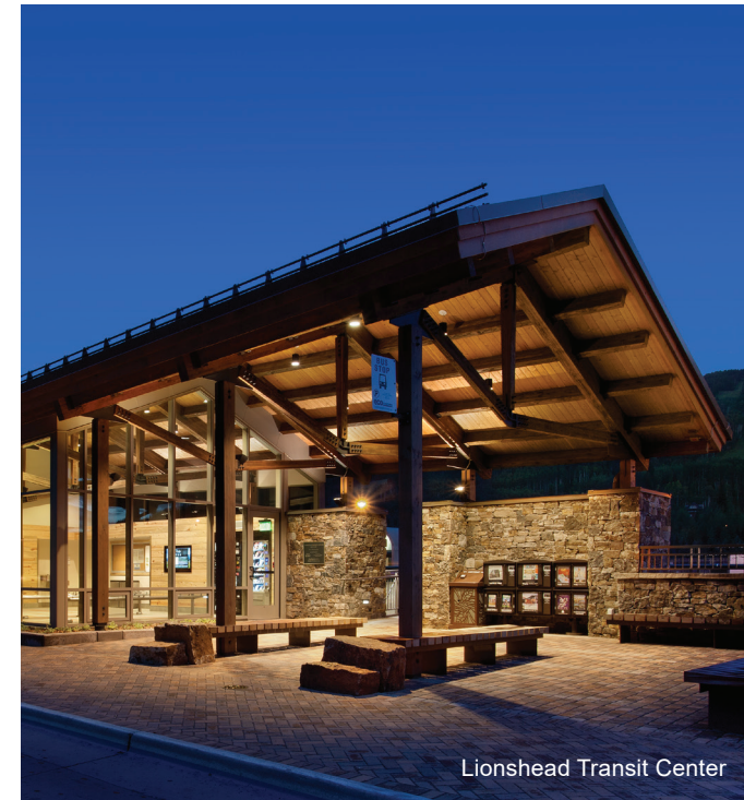
Lionshead Transit Center