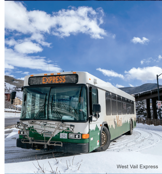
West Vail Express

NEW Vail Transit Real Time Information: ride.vail.gov